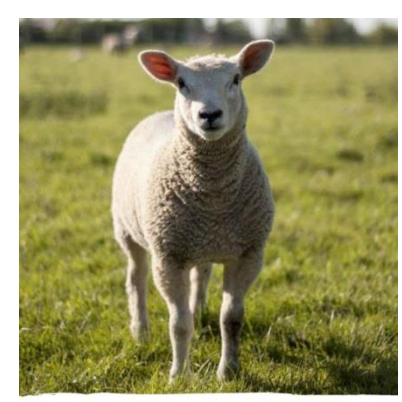
A VISION FOR BRITISH LAMB PRODUCTION

should be referring to it when working on the Governments 25-year food and farming plan. We should not forget that we are a tiny island but are still 11<sup>th</sup> in the world in terms of total