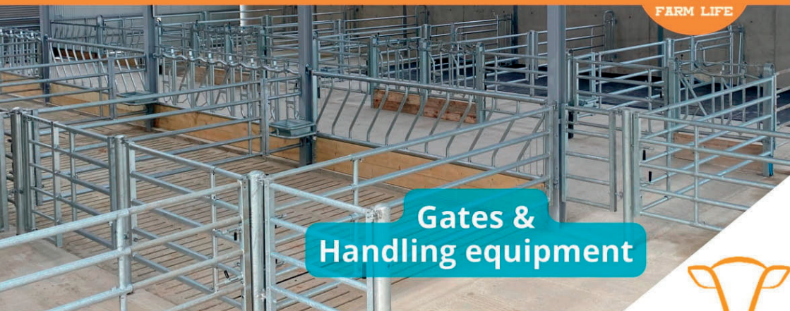
Gates & Handling equipment