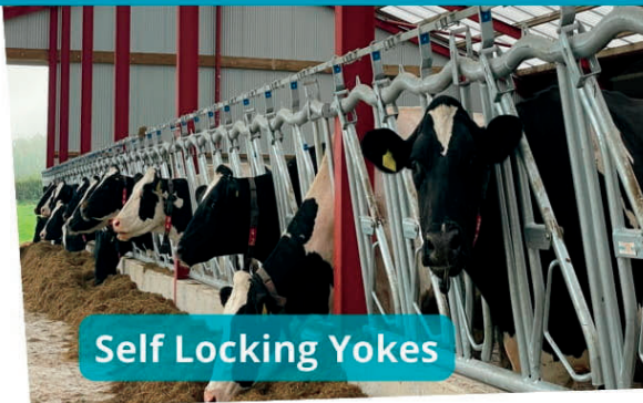
Self Locking Yokes