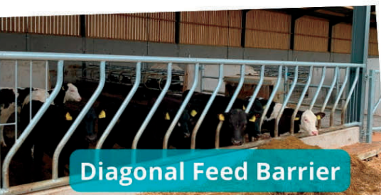
Diagonal Feed Barrier