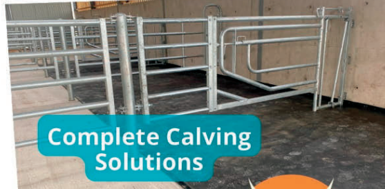
Complete Calving Solutions