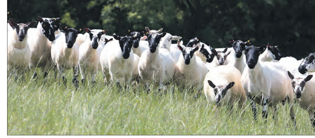
The flock used to run on a ranch system but Mr Thomas has implemented a rotational grazing system.

Mr Thomas says they have previously sent lambs to auction marts and other slaughter houses, but Dunbia is undoubt-