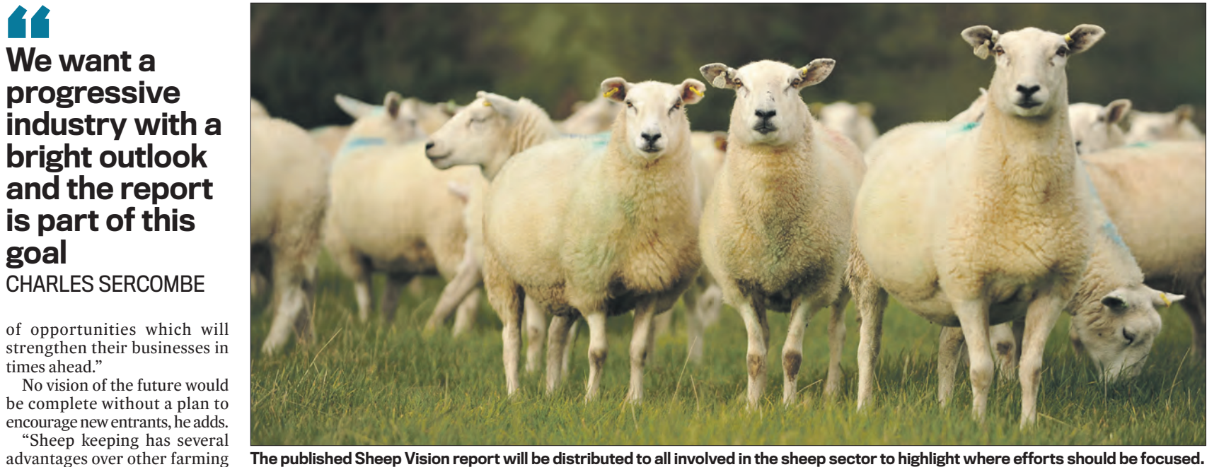
The published Sheep Vision report will be distributed to all involved in the sheep sector to highlight where efforts should be focused.

disseminated to NSA and NFU members and made available to others online The report is to be revisited at regular intervals in the future, so pressure is maintained to move the sector