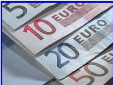
BPS Applications & Entitlement Trading