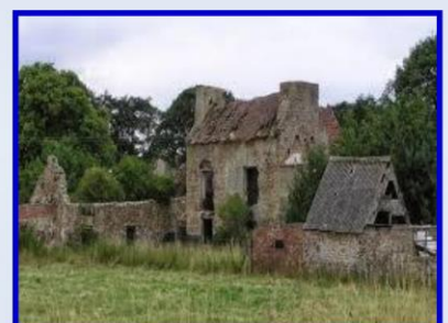
Rural Planning Matters