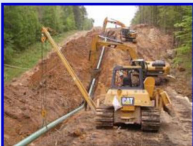
Compulsory Purchase, Land Acquisition and Compensation Matters