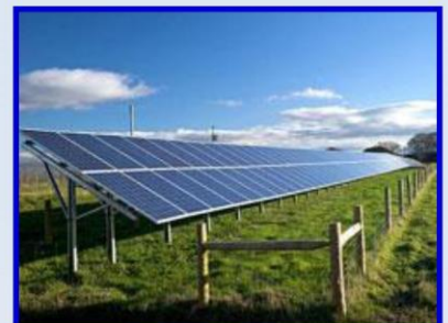
Farm Diversification, Renewable Energy & Feasibility Studies

For more information please contact our team of professionals at your local office: