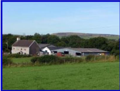
Town & Country Property Sales