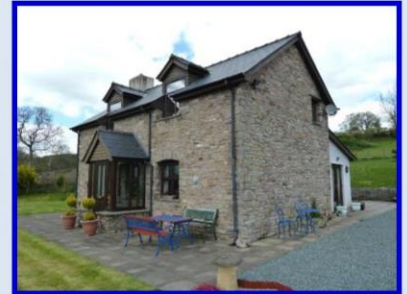
Town & Country Property Rentals