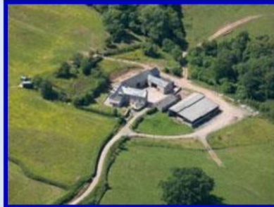
Valuations Including: Secure Lending Probate Expert Witness Inheritance Tax Capital Gains Tax Matrimonial & Partnership Dissolutions Charities Act